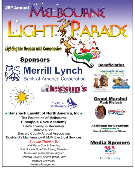
(1) 3' X 4' Full Color Registration Banner