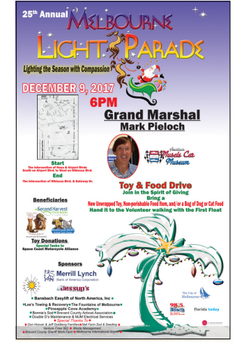
(500 Full Color Posters)